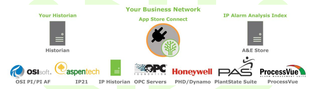
Figure 2-2 Business Network

The App Store Connect side sits on the clients (your network, that can be in your own server room, or increasingly it's on our client's own cloud infrastructure).